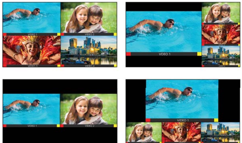
Quad position selectable