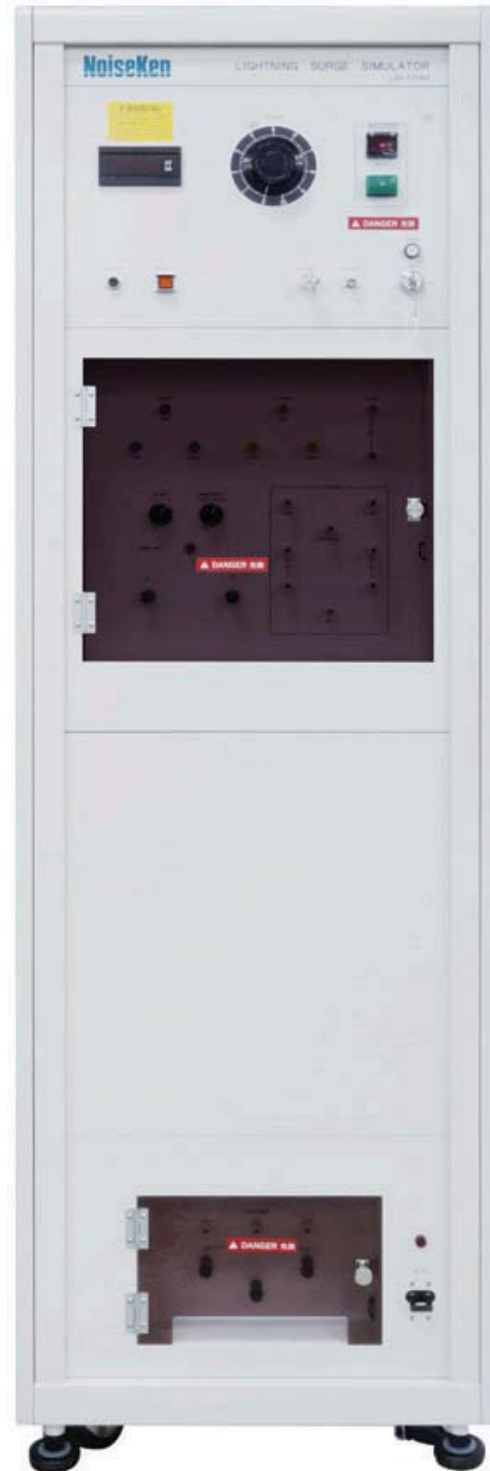
품명: 낙뢰시험기(20KV)/ Lighting Surge Simulator 모델명 : LSS-720B2